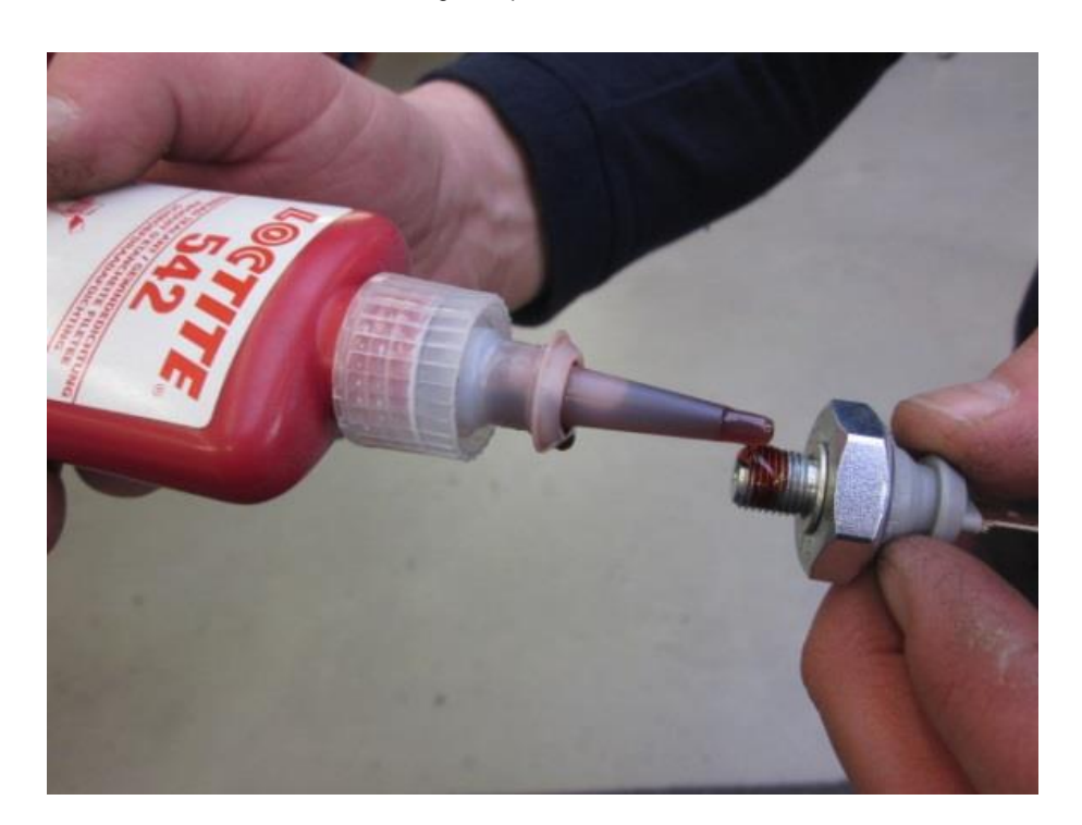
Fig. 2 Apply Loctite 542