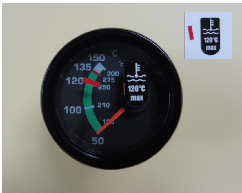
Fig. 3 – Modification of the CHT indicator to CT indicator