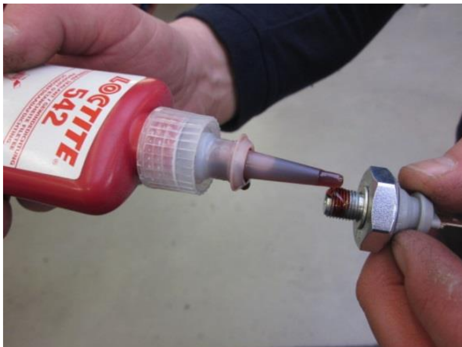
Fig. 2 Apply Loctite 542