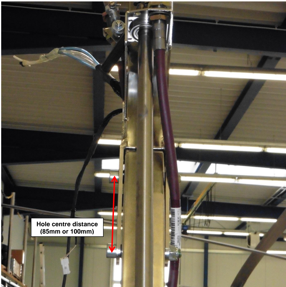
Fig 3: Calidus upper to lower mast connection hole distance